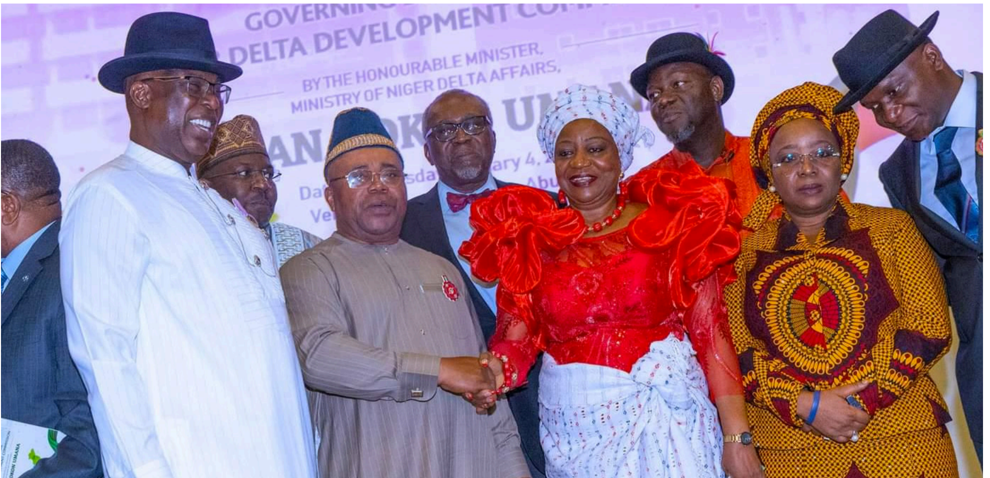
L-R: Minister of State for Petroleum Resources, Timipre Sylva; Minister of Niger-Delta Affairs, Chief Umana Okon Umana; new Chairperson, Niger Delta Development Commission (NDDC) Board, Ms Lauretta Onochie; Minister of State, Niger-Delta Affairs, Mrs. Sharon Ikeazor and others during the inauguration of the governing board of the NDDC in Abuja...on Wednesday.