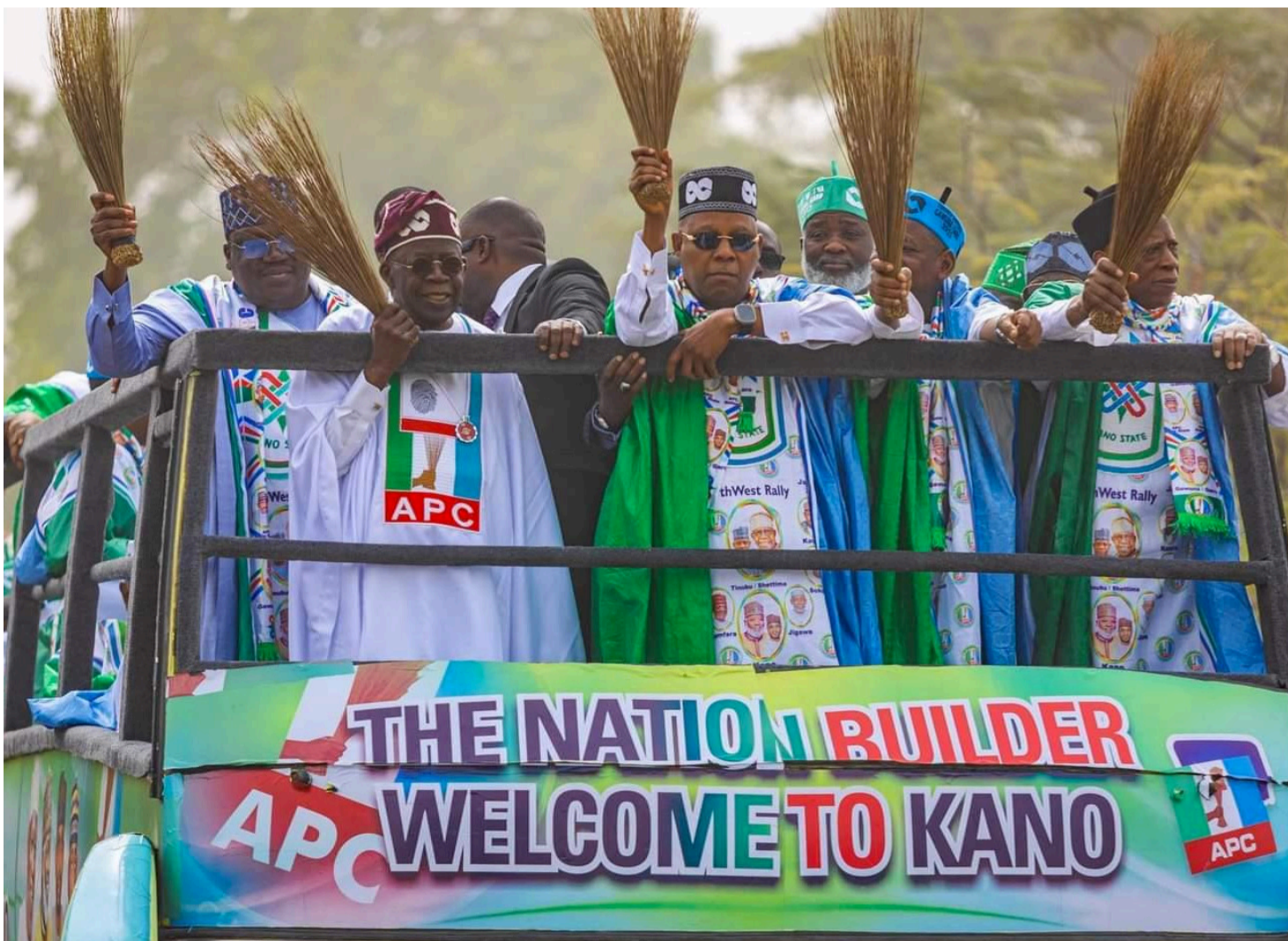
L-R: President of the Senate, Sen Ahmed Lawan; All Progressives Congress (APC), Presidential Candidate, Asiwaju Bola Tinubu; Vice Presidential Candidate, Sen. Kashim Shettima; Kano State Governor, Umar Ganduje; National Chairman, APC, Sen. Abdullahi Adamu and others during the Presidential rally in Kano...on Wednesday.

2023: Use your PVCs wisely, NASU tells Nigerian workers ⇒PG 9