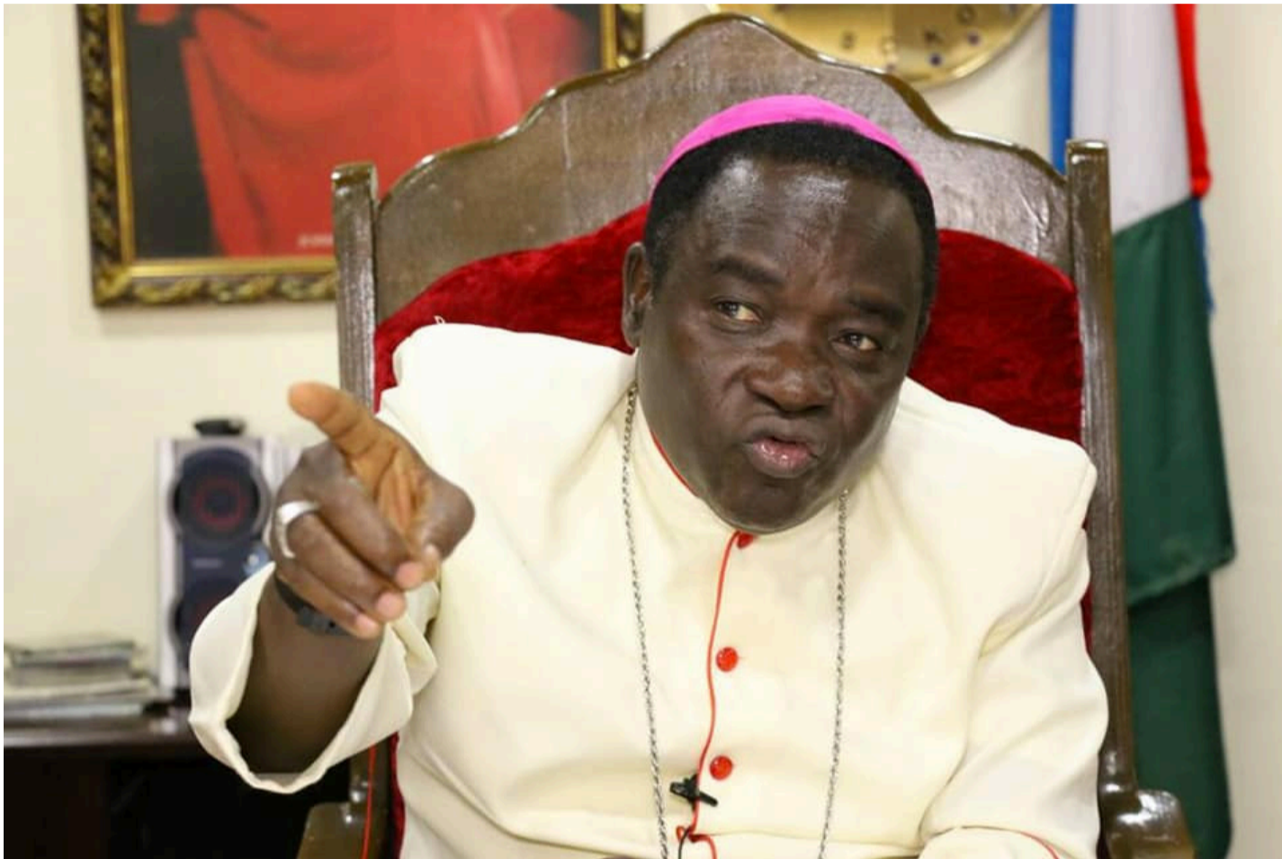
Bishop Mathew Kukah

Under the camouflage of 'speaking truth to power,' it has become a regular thing for the Catholic Bishop of Sokoto Diocese, Matthew Hassan Kukah, to take potshots at President Muhammadu Buhari, and the governing All Progressives Congress (APC).