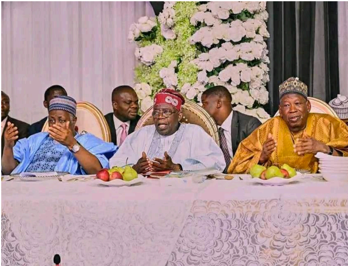
L-R: Jigawa State Governor, Mohammed Badaru; All Progressives Congress (APC), Presidential Candidate, Asiwaju Bola Tinubu and Kano State Governor, Umar Ganduje during a meeting with Islamic scholars from North West region at Amani Event Centre in Kano State...on Tuesday.