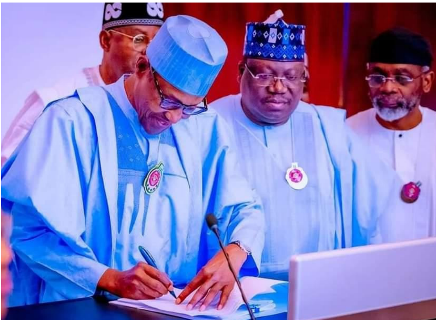
L-R: President Muhammadu Buhari; President of the Senate, Sen Ahmed Lawan and Speaker, House of Representatives, Rt Hon. Femi Gbajabiamila during the Signing of the 2023 Budget into Law by Buhari at the State House, Abuja...on Tuesday.

NIS recue 6 human trafficking victims in Jigawa ⇒PG 7