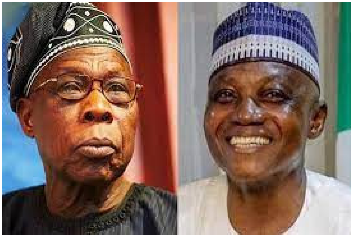
(L-R) Olusegun Obasanjo and Garba Shehu

Thanks for seeking our reaction. Former President Obasanjo is so well known to all that no one needs to describe who he is.